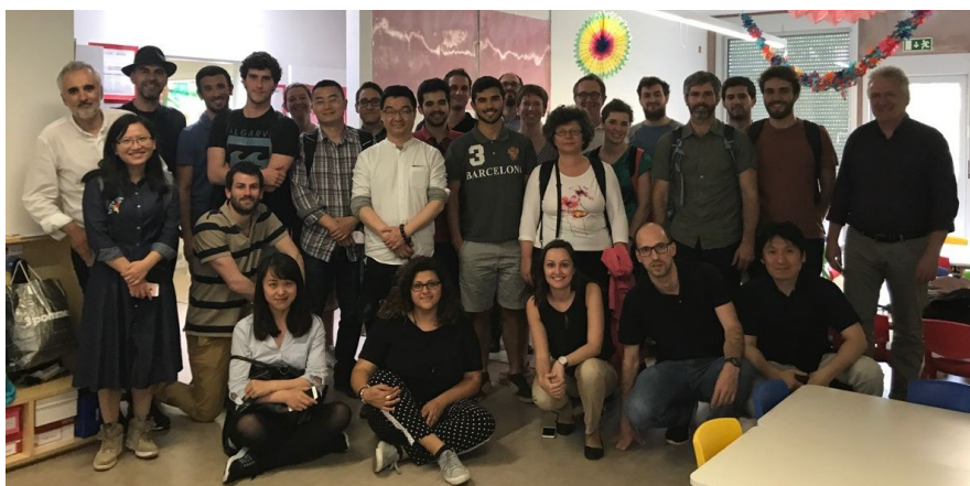
IEA EBC Annex 62 summer course on ventilative cooling