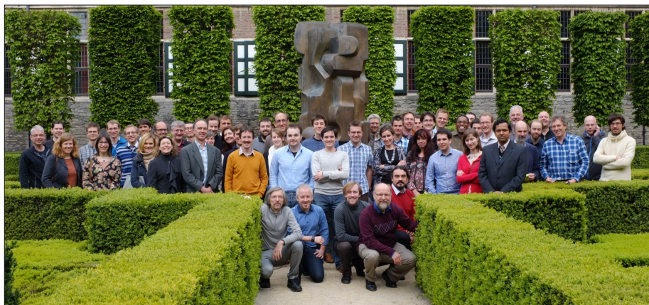
Above left: The Annex 58 group has become larger and larger, showing the increased interest in the topic of IEA ECB Annex 58 on "Reliable building energy performance characterisation based on full scale dynamic measurements"

This newsletter focusses on the progress in the work on dynamic analysis and simulation in the Annex 58 project, reports on a number of past information events and calls for a new training session. You are welcome to share your knowledge and take advantage of this growing source of competence. Join this community.