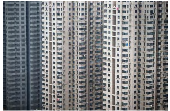
Multi apartment building in Beijing, China

Dynastee is involved in the new IEA project Annex 71. Two contributions tell you more about the aims and the work programme of this project. A workshop on in situ measurement methods is organised in April in collaboration with standardisation working group 13 of CEN TC 89. You will hear about the outcome in the next issue of this newsletter. Moreover, young researchers can improve their skills in dynamic analysis during a new Summer School training session in Spain. The announcement on the dynastee.org website tells you how to register. Two new U-value measurement approaches are also presented. It may inspire you in your own work.