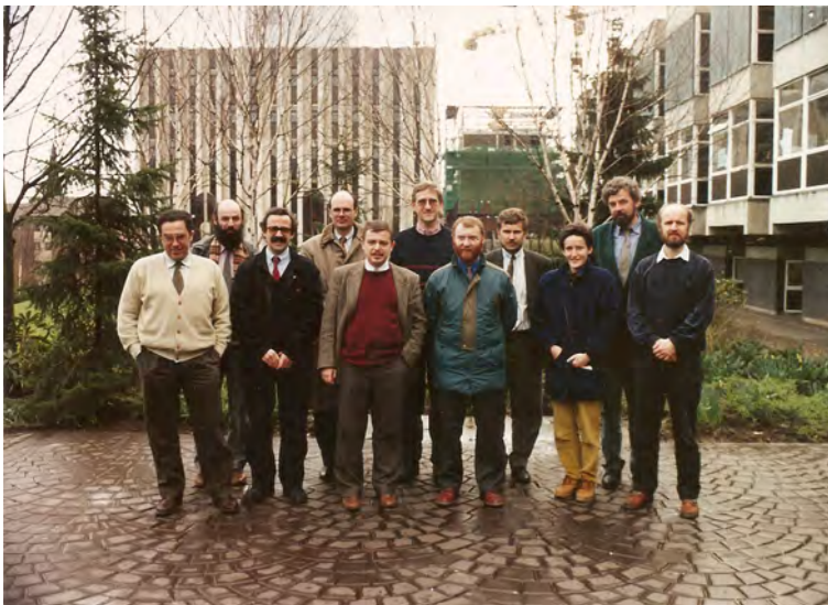
Some members of the PASSYS MVD group

Recent research undertaken within IEA EBC Annexes has led to a return to empirical validation of detailed building energy simulation programs, notably in IEA EBC Annex 43 in 2003-7 and more recently within IEA EBC Annex 58 in 2011-16 to which many Dynastee participants contributed. As part of Annex 58, detailed experimental specifications and high quality datasets were obtained for validation experiments carried out at Fraunhofer IBP Twin Houses in Holzkirchen, Germany. Over 20 sets of model predictions from 15 organisations using 12 different programs were submitted and compared to the measured data in an iterative process. A paper in the Journal of Building Performance Simulation (2016 Vol 9(4)), "Whole model empirical validation on a full-scale building" summarised the outcomes from the first of these experiments. It is intended that a further validation experiment will be conducted in the recently commenced IEA EBC Annex 71, this time including not only the building envelope but also systems and synthetic occupancy. As detailed simulation programs become more routinely used for design of low energy buildings and regulations compliance, there is a continuing need to ensure that the resulting model predictions are reliable.