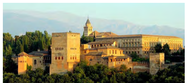
View on the Alhambra in Granada, Spain