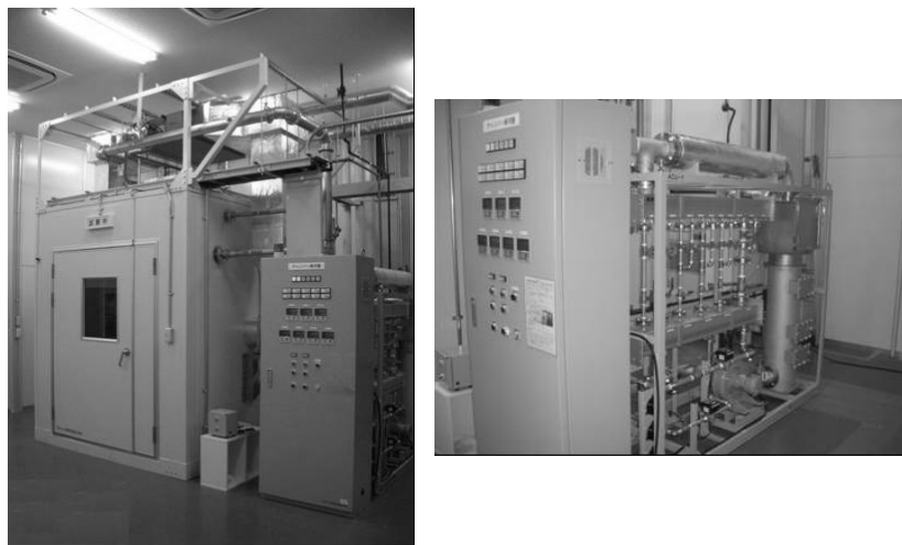
Figure 1 5 m 3 emission test chamber (Left: appearance of emission test chamber and control panel, Right: Clean air supply system)

structural materials and the air purification system.